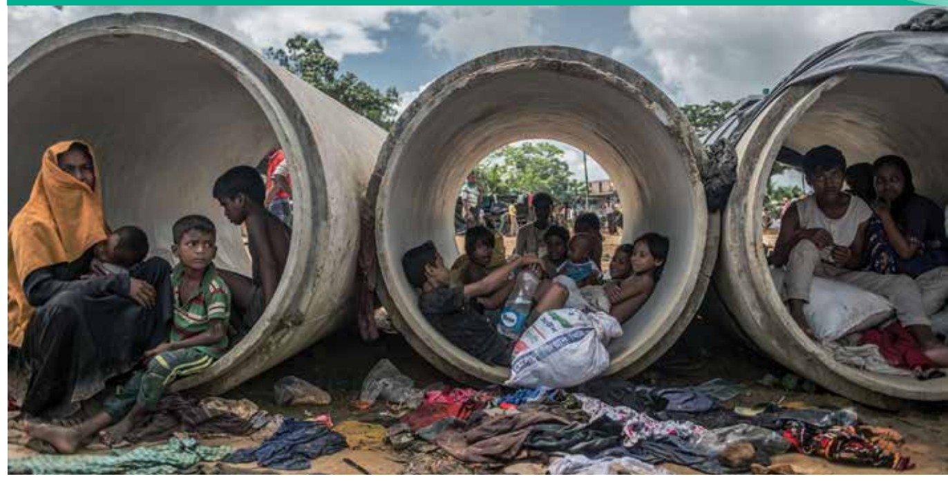
Rohingya refugees shelter in drain pipes at a reception area in southern Bangladesh.

BANGLADESH Escalating tension and violence in Myanmar's Rakhine State has led to a refugee crisis in neighboring Bangladesh, which is hosting an estimated 688,000 Rohingya refugees. Their needs are tremendous and include shelter, food, water, living supplies,