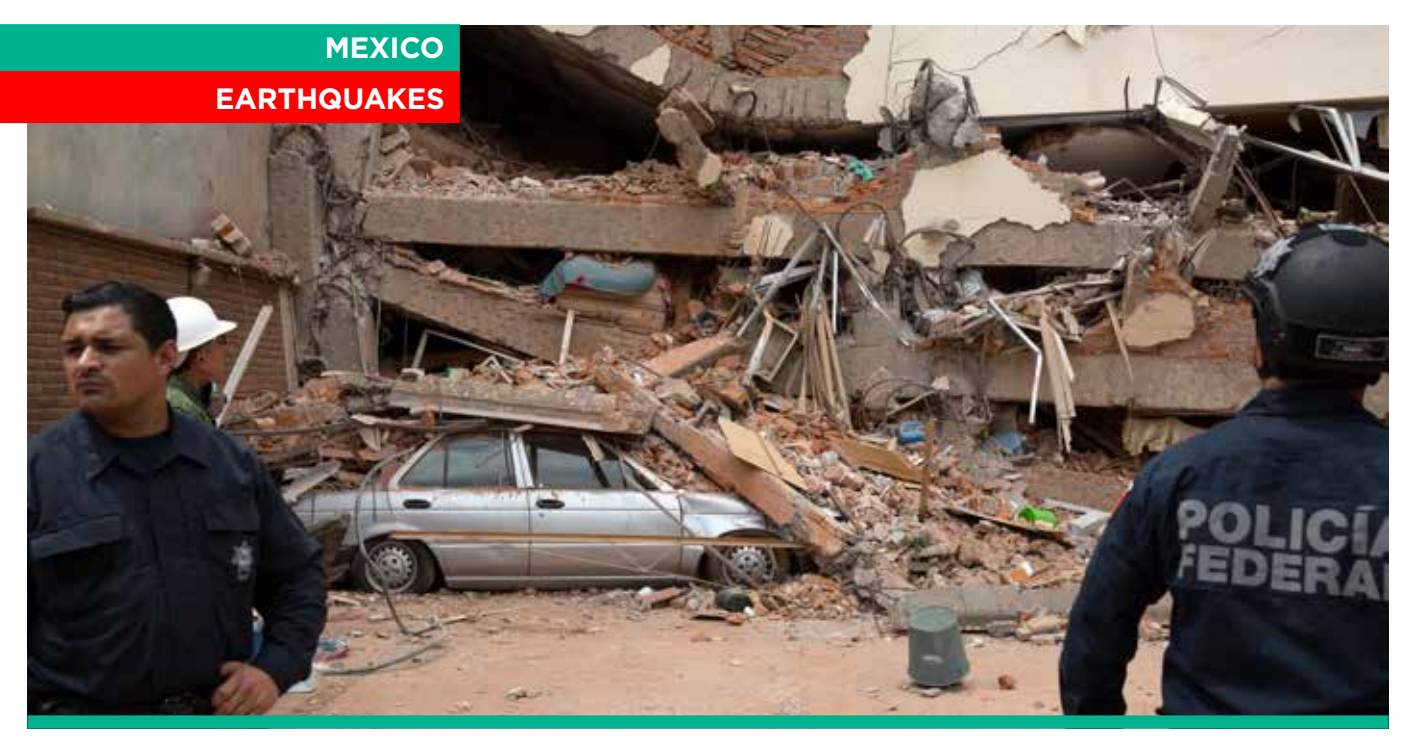
A collapsed building in the Lindavista neighborhood of Mexico City.

The 8.2-magnitude earthquake that struck southern Mexico on September 7, 2017, caused nearly 100 deaths and damaged 110,000 buildings in Oaxaca and Chiapas. It was followed just 11 days later by a 7.1-magnitude earthquake that destroyed buildings across Mexico City, killing 220 people in the city and 140 in surrounding states.