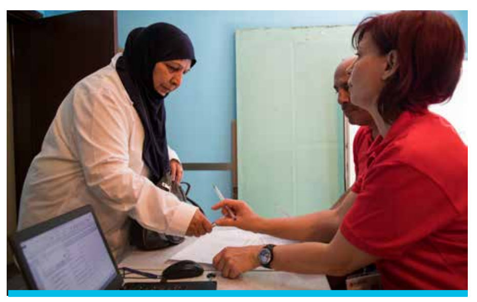
Caritas Sofia provides vouchers to help vulnerable refugee women and families buy food and living supplies.

CRS and Caritas teams help refugees and migrants to access the labor market and secure paid employment. We also help refugees obtain documents and job-readiness skills, and link them with potential employers. Social networks are strengthened through a program that pairs refugees with host community members in "buddy" programs. Language classes and job-readiness support can significantly increase refugees' chances to succeed.