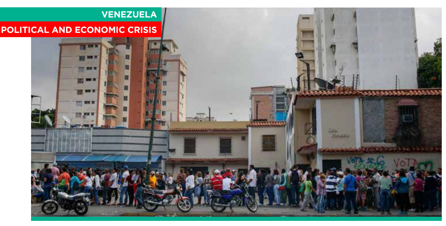
In cities like Caracas, food and medicine are in short supply—and lines are long.

Political and economic instability have left Venezuelans without access to food, medical care or basic government services. More than 2 million people have fled the country, and tens of thousands have been killed since 2016.