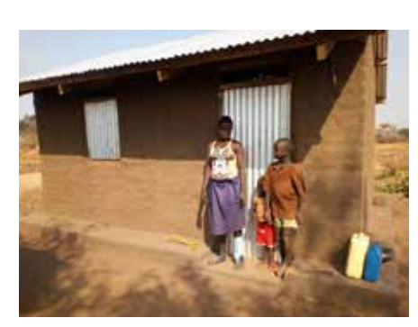
A family moves from an improvised shelter to a new CRS shelter.