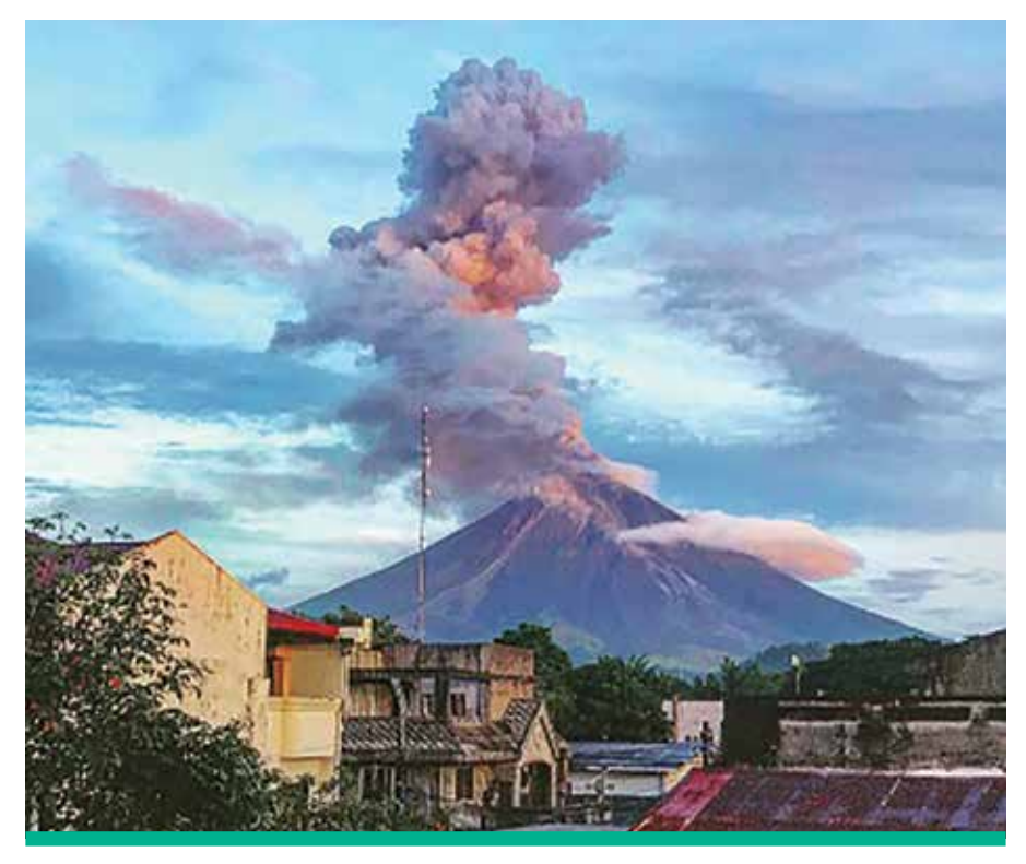
After a series of volcanic eruptions, Philippine authorities declared a danger zone within a 6-mile radius of Mount Mavon's summit.

CRS and our local partner conducted a rapid assessment of evacuation centers to identify the most vulnerable people. We found that centers in local schools were housing up to 150 people per classroom. Many people were sleeping outside or in chairs. The overcrowding puts significant pressure on the water supply and latrines. Local churches are encouraging volunteer families to host evacuees.