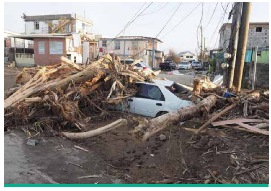
Hurricane Maria caused flooding and dozens of landslides across the island of Dominica.