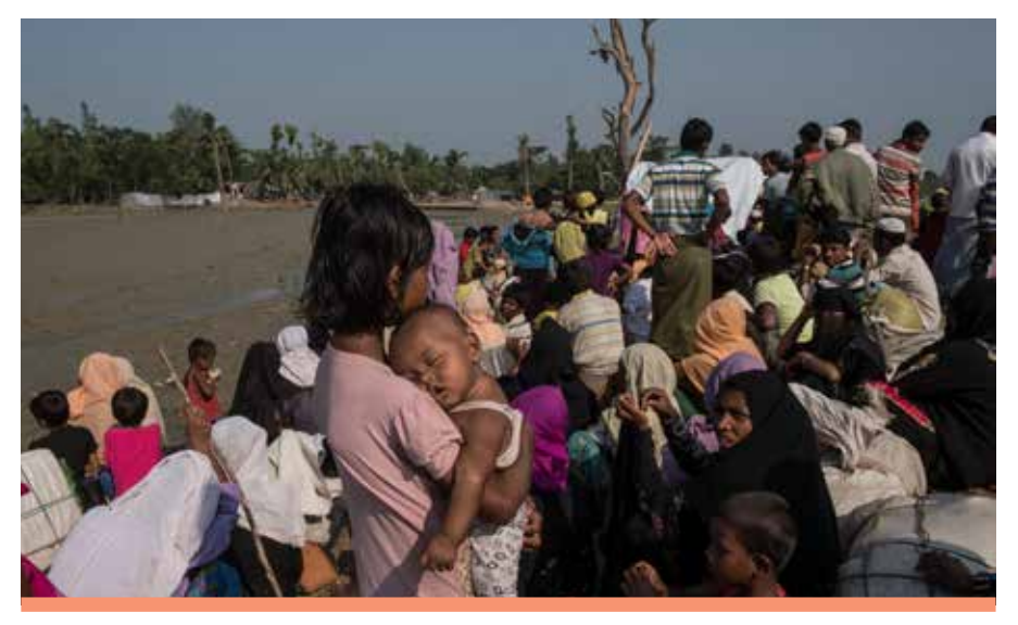
At Shabrang Harbor in Teknaf on the Bangladesh border, Rohingya refugees gather after arriving by boat from Myanmar.

Refugees are living in crowded, unsanitary camps, completely dependent on aid to meet their most basic needs. By the time they reach the camps, families have used most of their savings on their transportation and shelters, often made out of no more than bamboo and recycled plastic sheets.