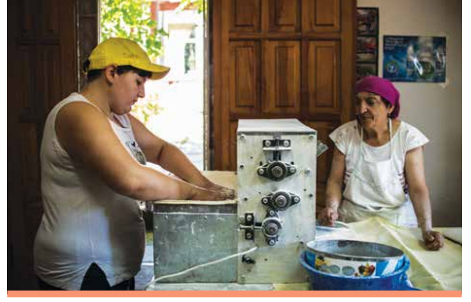
This bakery was started with Caritas Ukraine support and receives an employment grant to hire internally displaced people.

The security situation remains tense, with regular ceasefire violations and shelling in residential areas. The damage to infrastructure is influencing everyday life, with pumping stations, water treatment plants and power lines affected. Farming, a key source of income, has been seriously hampered due to hostilities and land mines. This year, a reported 27 farmers were killed in mine-related incidents.