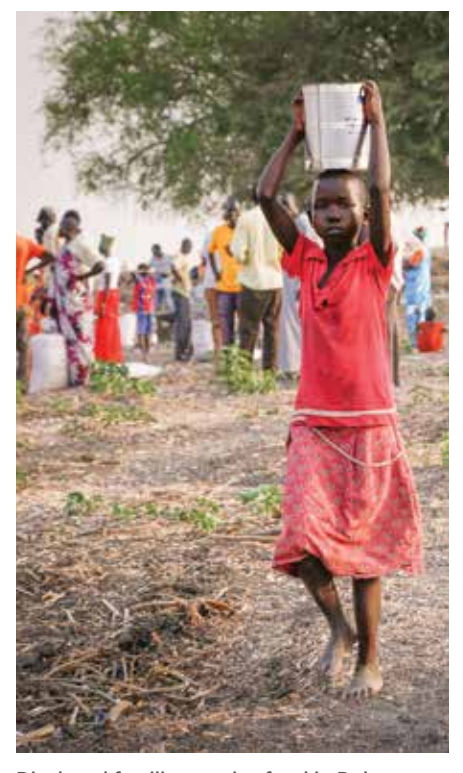
Displaced families receive food in Duk County, South Sudan.

LAKE CHAD BASIN More than 10 million people in one of the world's poorest, most drought-prone regions are estimated to have been affected by the Lake Chad Basin crisis, now in its seventh year. Across Cameroon, Chad, Niger and Nigeria, Boko Haram has killed thousands of people and 2.4 million have fled their homes. CRS is responding with emergency relief in all four countries.