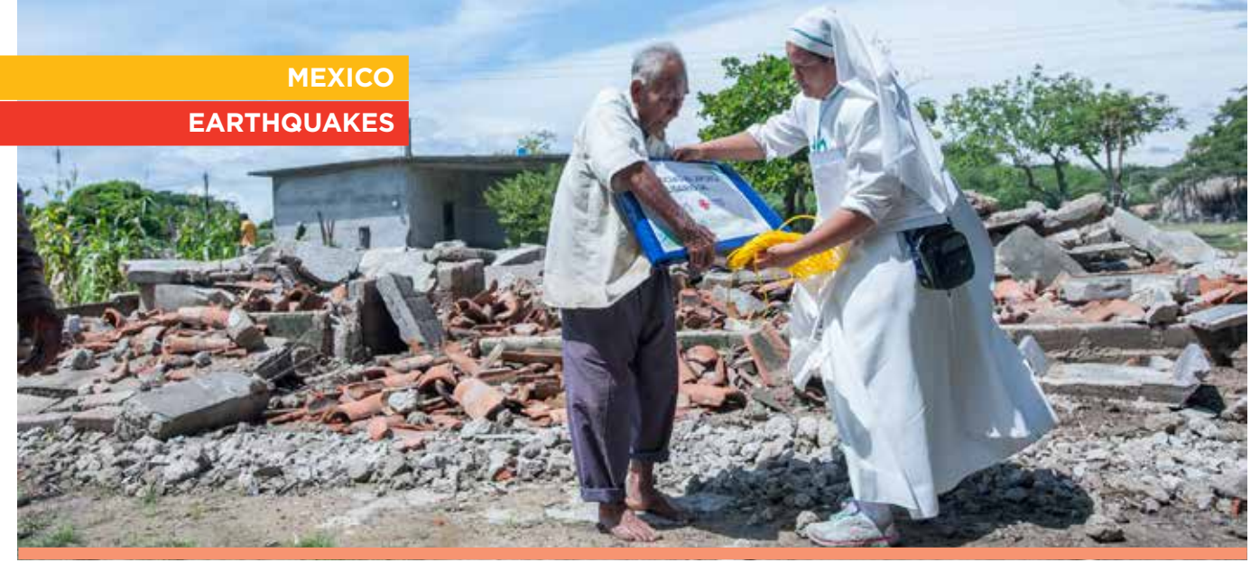
CRS distributes emergency shelter materials to earthquake-affected communities in Oaxaca.