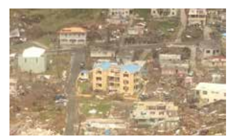
Damage on Tortola, the largest of the British Virgin Islands, after Hurricane Irma.

THE CARIBBEAN Hurricanes Irma and Maria have resulted in loss of life, property and infrastructure, and hundreds of thousands of people have been displaced. CRS is providing food and shelter, water and hygiene kits, and, in the British Virgin Islands, has set up a database to register government-approved beneficiaries.