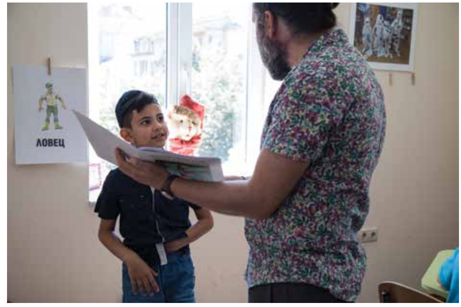
A Syrian refugee takes language lessons in Bulgarian at the Caritas Sofia offices in Bulgaria.

The initiative was shepherded by the CRS BiH program, which will also look to promote local scholarships, and identify potential internships and job placements with mayors and other public and private key stakeholders.