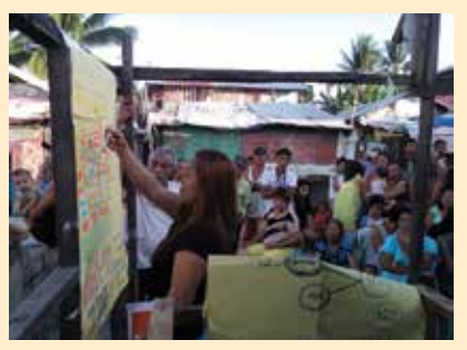
Rowena Bohol, a community leader, presents the results of the social and resource map made during community consultation activities.