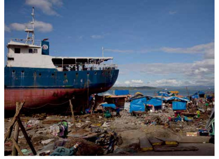
CRS has helped communities who lived in vulnerable coastal locations, like this one in Tacloban City, resettle in safe areas.