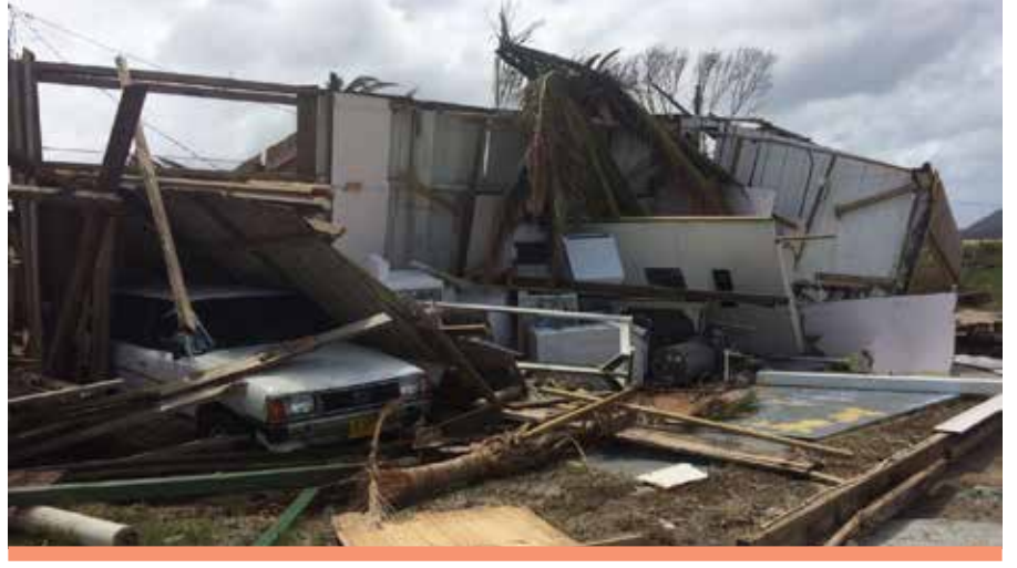
A quarter of homes are reportedly uninhabitable in the British Virgin Islands, where CRS is helping register vulnerable households.

Dominica: Ten days after Hurricane Irma struck the region, another Category 5 storm. Hurricane Maria, hit the island of Dominica. Reaching speeds of up to 160 miles per hour, Irma was the first Category 5 hurricane to have made landfall there. The whole island was affected, suffering dozens of landslides and flooding. The official death toll stands at 38. Many roads are now cleared, but heavy rains have caused additional landslides. Schools have been used as shelters. Food, water and electricity are still in short supply.