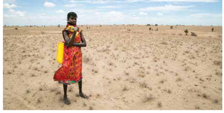
Turkana, in northern Kenya, has been hit by severe drought, and food security is deteriorating.