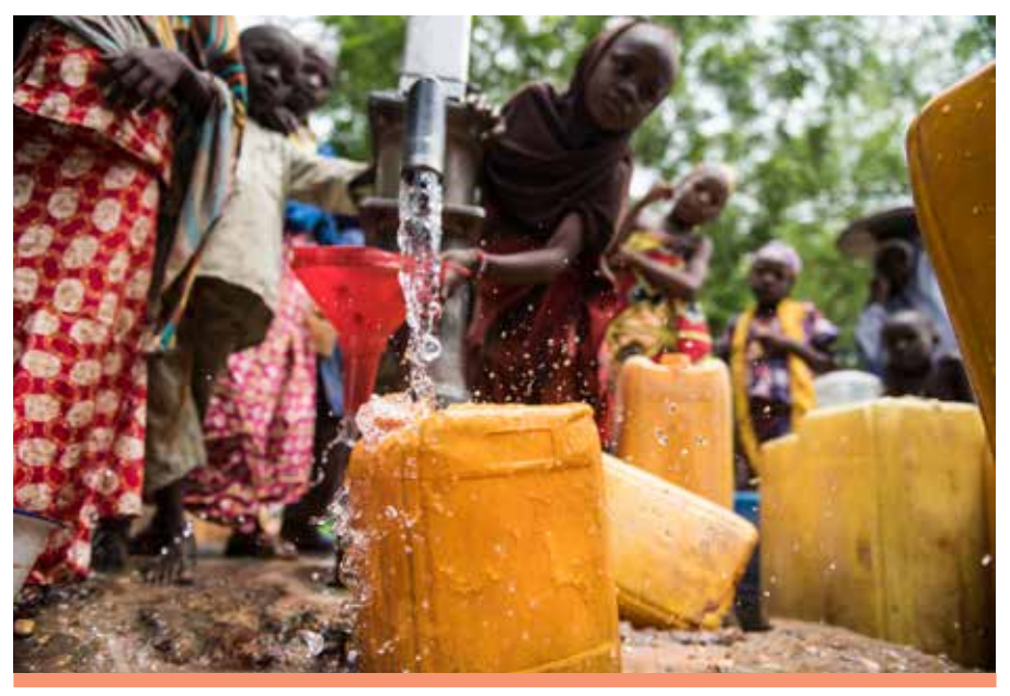
In the village of Rara, Nigeria, children fetch clean water from a borehole rehabilitated with support from CRS, and our partners and supporters.

Ongoing military operations and attacks by armed groups have severely limited access by humanitarian organizations and triggered new waves of displacement, particularly in