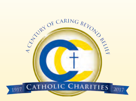
Catholic Charities will be celebrating 100 years of Caring Beyond Belief in 2017. See page 6 for upcoming events to commemorate this centennial anniversary!