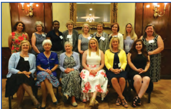
The Newest Members of the Ladies of Charity in Albany

The Ladies of Charity in Albany are not only one of this year’s honorees at the annual Night at the Museum, they are also celebrating their 400th anniversary. Founded in 1617 by St. Vincent de Paul, the Ladies of Charity are a volunteer organization of lay members dedicated to providing service to the poor. They are one of the oldest, continuously functioning organizations of their kind. Since being founded in Albany in 1970, they have proven to be a vibrant presence throughout the Capital Region.