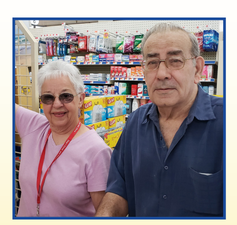
Seniors can live independently and remain in their homes, thanks to support from HOPE Ministries volunteers.