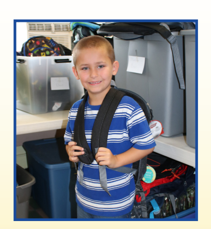
At Conserns-u, students could pick our their own brand new backpack for the school year.