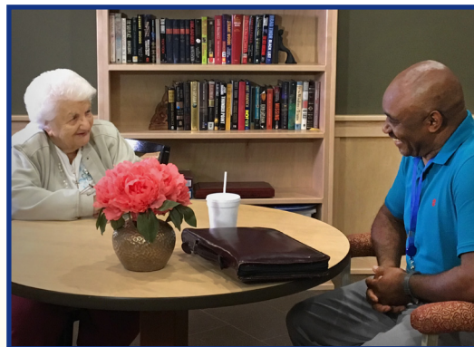
Through the Long Term Care Ombudsman Program, volunteers work with residents of long term care facilities to see their needs are met.