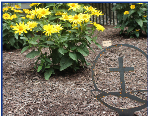
A new Memorial Garden stands in Albany in honor of the clients, staff and friends we've lost through the years.