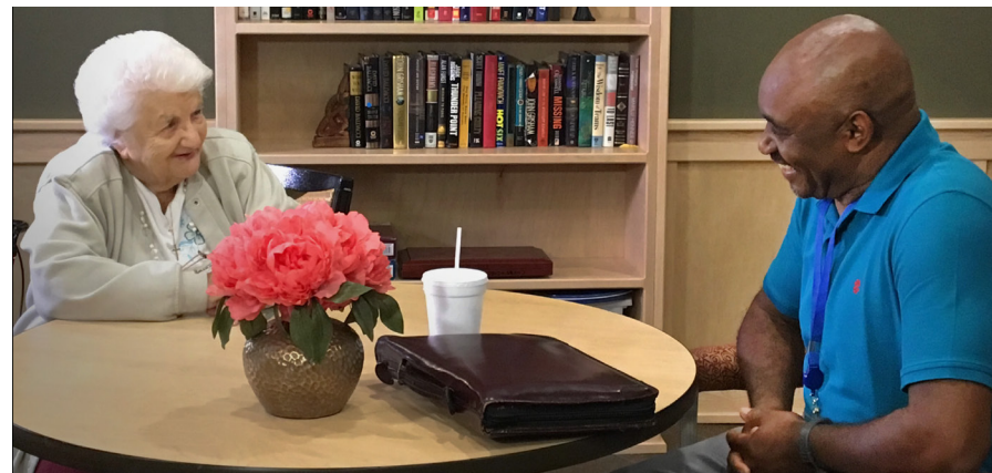
Above: Ombudsmen visit with residents in long term care facilities to assess their needs and address their concerns.

Ombudsmen do just that: they help residents of nursing homes and other long term care facilities. Through the LTCOP, trained volunteer Ombudsmen work with long term care residents and their loved ones to identify and then address any concerns around quality of life or quality of care. They act as an advocate and a liaison, working with the facility staff to see residents' needs are met.