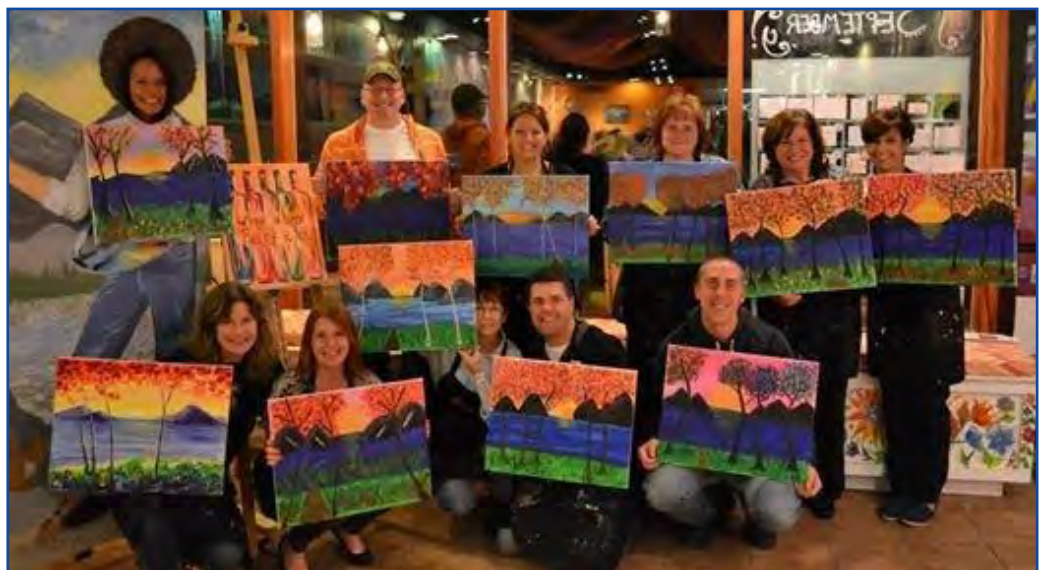
Catholic Charities Disabilities Services Staff, Board Members, and friends pose with their Paint & Sip paintings. It was a fundraiser for their Families in Need fund for emergency assistance and basic needs.

If you would like to receive CC Works electronically, please send your e-mail address to catholic.charities@rcda.org . The money we save can be used to directly support those in need. If you would like to continue to receive a paper newsletter you need to take no action. Thank you!