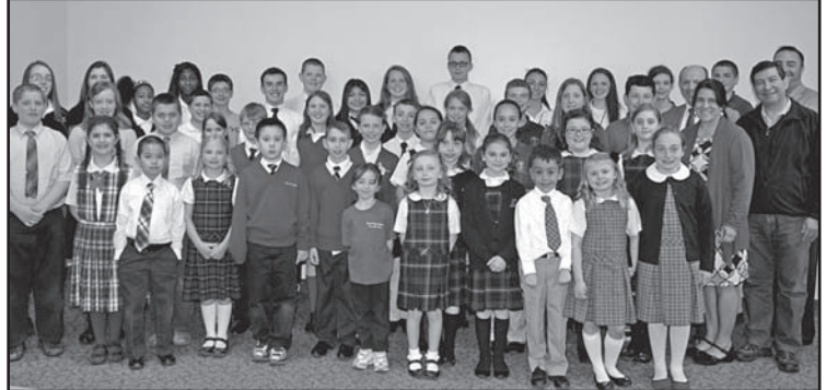
14 Catholic Schools from the Albany Diocese were represented recently at the Rice Bowl Luncheon as they volunteered their time to raise money for Catholic Relief Services.