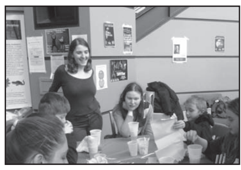
Children in the Saratoga Mentoring Program work on their Earth Day projects of making water filters after getting instruction from Skidmore College students.

On a recent Saturday afternoon Skidmore College in Saratoga Springs was not only home to a group of college students working on their papers or deciding how to spend their Saturday night, it was also a safe place for a group of children participating in the Saratoga Mentoring Program operated by Catholic Charities of Saratoga, Warren, and Washington Counties. The program currently has a total of 39 matches made up of children who are in need of one-on-one interaction with an adult role model, and adults